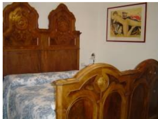
Bedrooms with Antique furniture made from olive trees